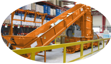
Option: conveyor belt

A completely automated waste management solution designed for continuous infeed, automatic horizontal or vertical strapping system with adjustable wire links, which enables you to yield optimal output.